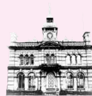
The Geoffrey Iley Stage @ Towcester Town Hall