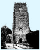
St Lawrence Church