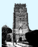
St Lawrence Church